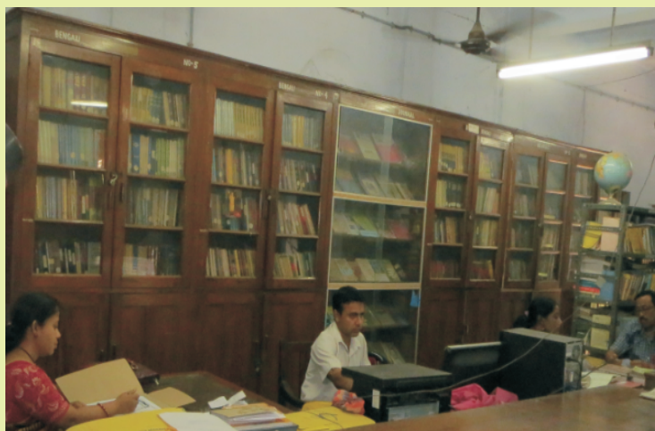
Library Staff Members