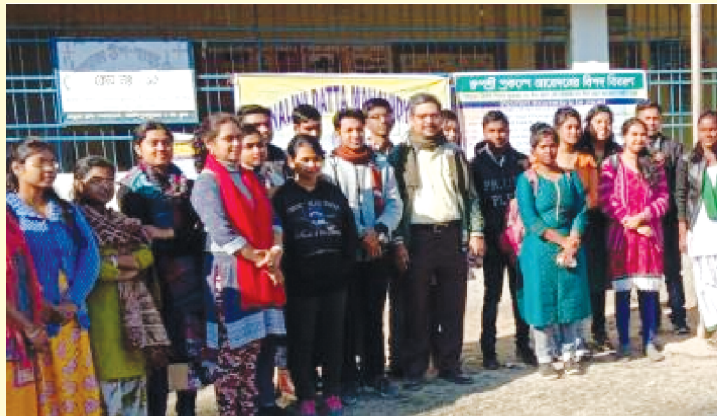
Field visit and awareness camp at Andu Bana Basti, Alipurduar District.