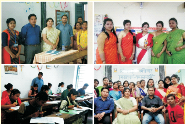
Departmental Programme and Examination