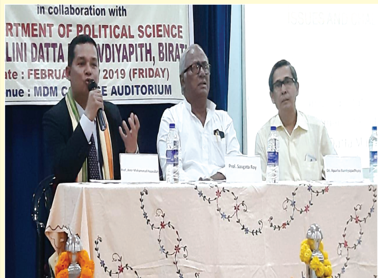
A much needed programme (Seminar on : Gender & Beyond ) Organised by IQAC