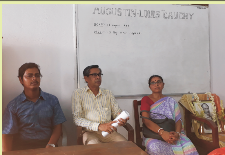
Birthday Celebration of Augustin-Louis Cauchy