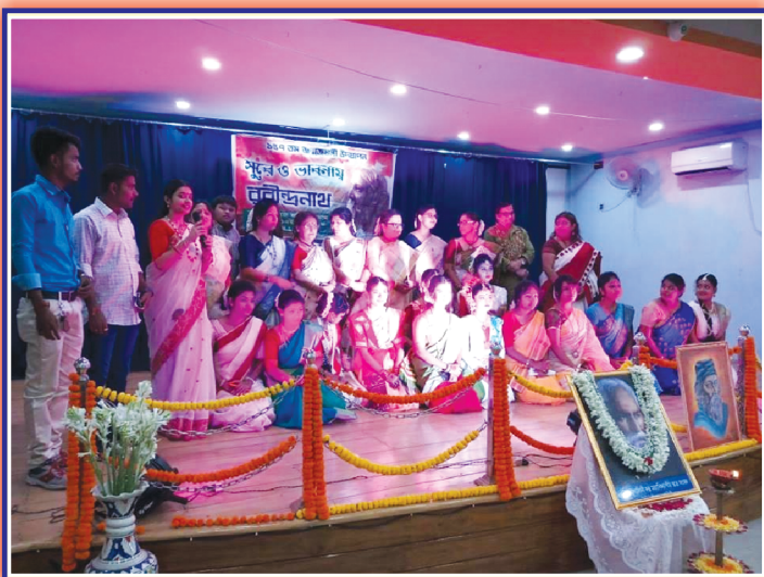
Rabindra Jayanti Celebration by Cultural Sub-Committee