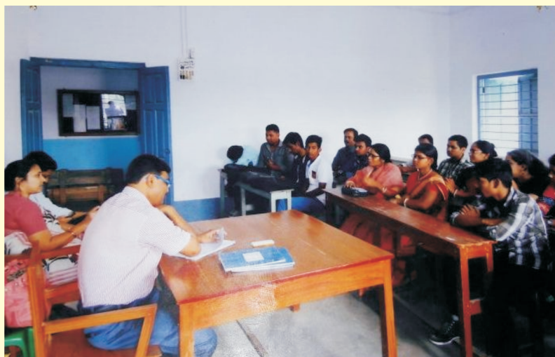
Parents-Teachers Meeting of the Department