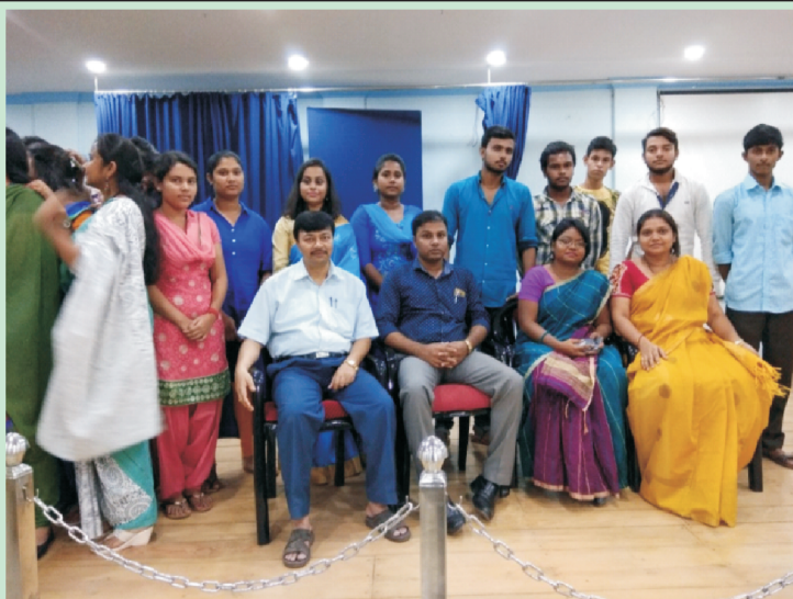
Academic Counselling Programme for 3 rd Year Students