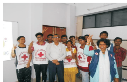
Workshop of YABC (Youth as Agent of Behavioural Change)