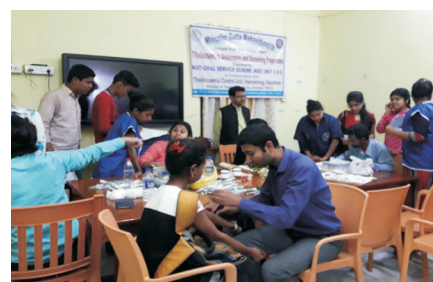
Thalassemia awareness programme

Contact us (Mob. 9874556847 / 9836624446) for enrolment and training programme.