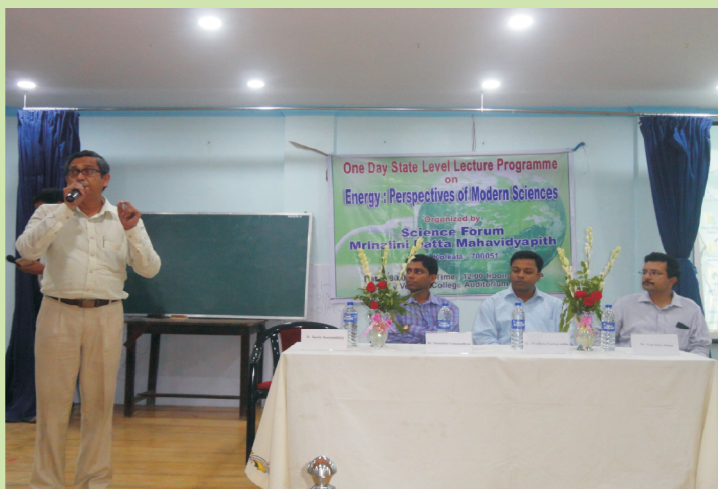
Participation of the department in science forum programme