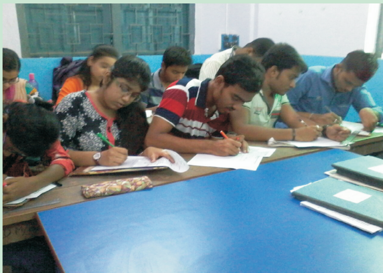
Students of the department