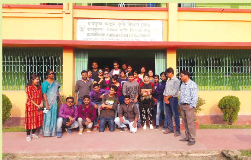
Local excursion in Sri Ramakrishna Ashram Krishi Vigyan Kendra, Nimpith, 24Pgs(S).