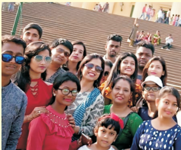
Educational excursion at Murshidabad