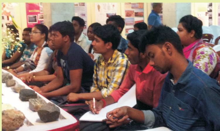
Students undergoing Hands-on Training Course on Rocks and Minerals identification at GSI