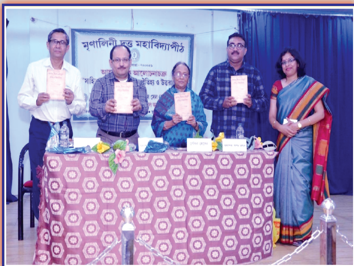
Moment of Pride : Prestigious Book Release in the IQAC collaborated International Seminar