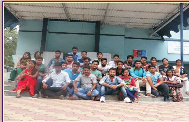
Mukta Mancha of our College