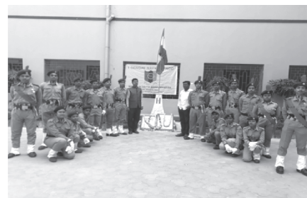
Celebration of Republic Day by NCC Cadets

Contact us (Mob. 9243269721) for enrolment and training programme.