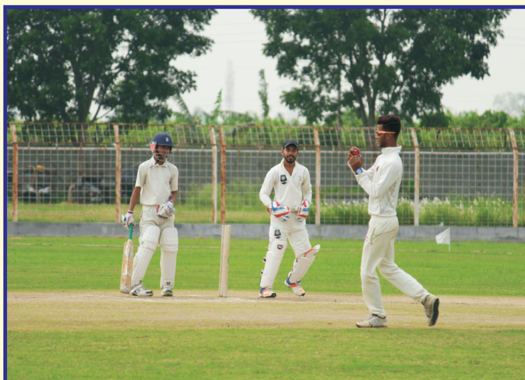
Cricket Match in progress