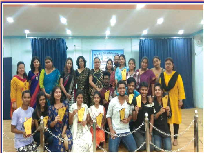
Intra college competition organized by Cultrual Committee