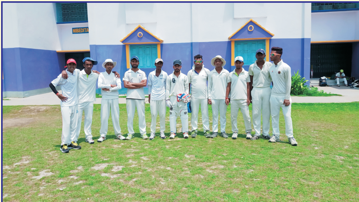
Cricket team of our college