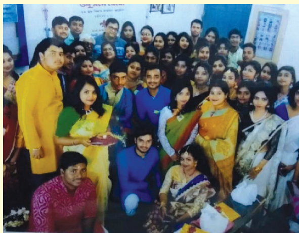
Basanto Utsav at the department