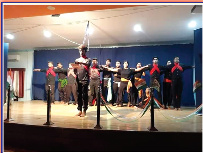
TROUPE members winning hearts