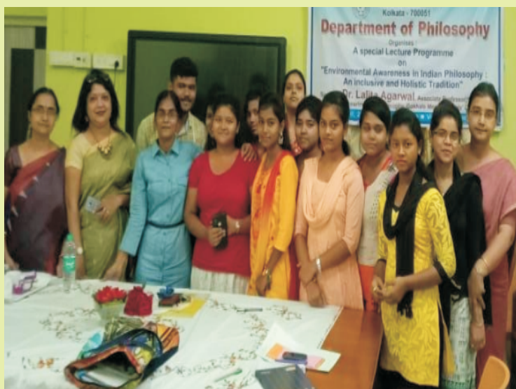
A special lecture programme