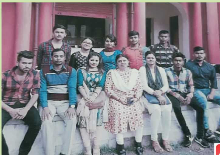
Educational Visit at Jorasanko Thakurbari (RBU), Kolkata.