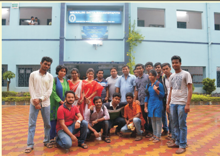
Students and faculties of the department