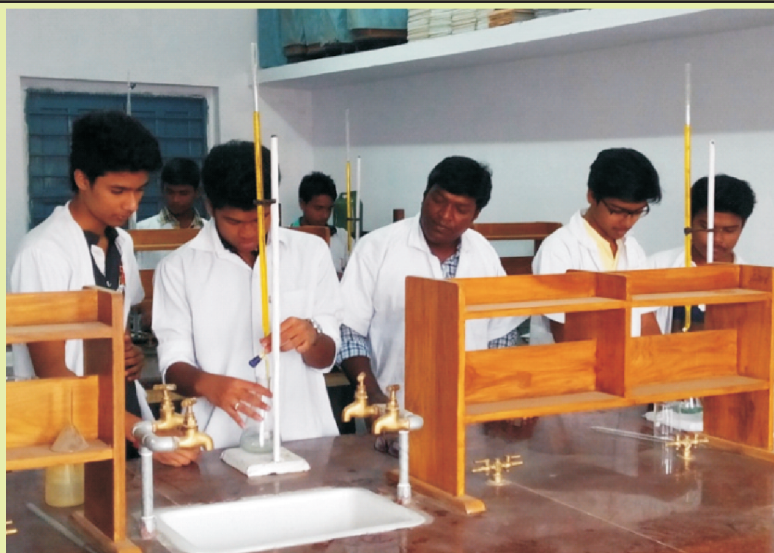
Students are doing practical in laboratory