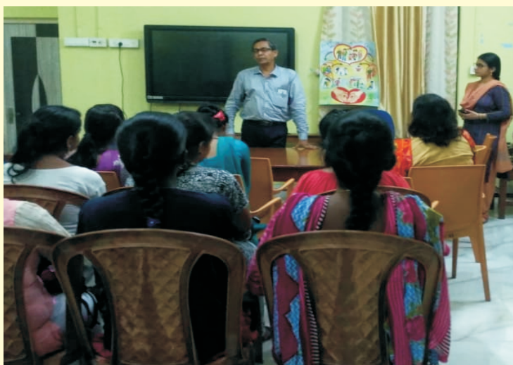
Departmental programme of Family Values