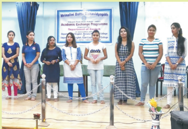
Academic exchange programme