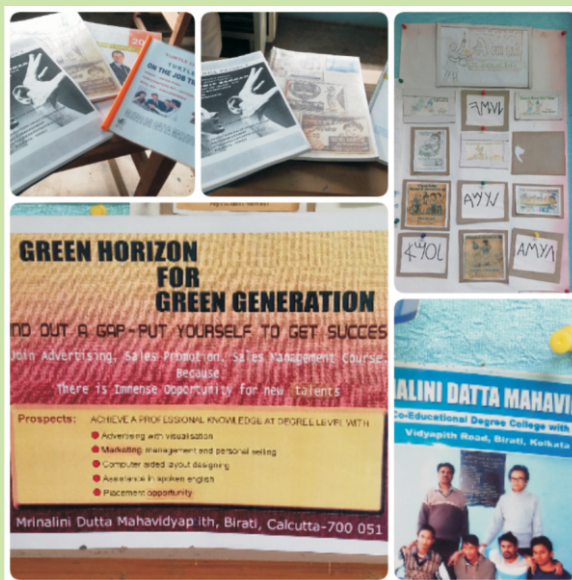
Year round activities of the department

The goal of education is not memorizing the academic content but construction and reconstruction of life experiences and relating them to the academics thereby acquiring higher orders of learning. B.Com. General Course with advertising & Sales Promotion aims at equipping students with finer nuances of advertising, Sales Promotion, Public Relations and Sales Force Management. This program enables the students to develop skills required for job/vocation in advertising, personal selling and salesmanship. On the other hand, a student also will be equipped with skills required to motivate and train the sales force and enhance their productivity.