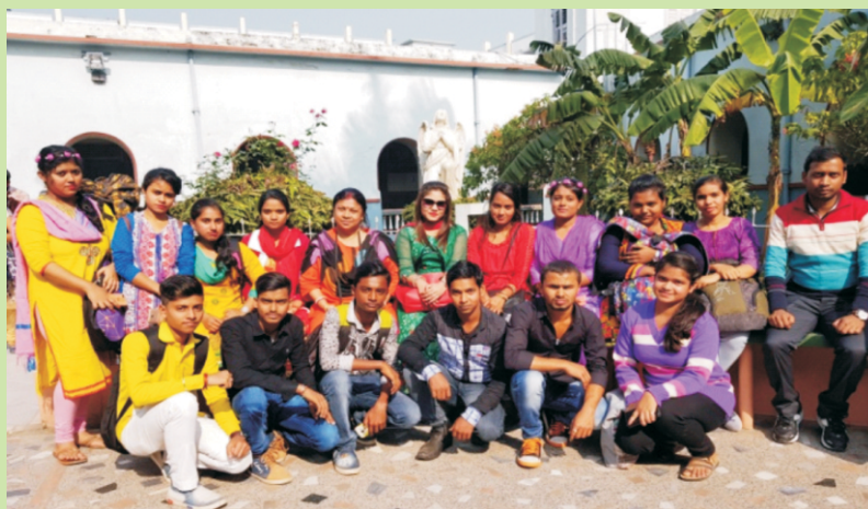
Educational excursion of the department at Bandel Church

The Department of Political Science is one of the oldest departments of the college and started its journey in 1964. Honours course was introduced in 1968. Apart from regular class room based academic exercise, the department has a tradition of organizing various seminars, and special lecture programmes. The Department maintains well stocked Departmental library comprising over 250 books and journals. The Department publishes its own bi-lingual annual journal "Forum" and bi-lingual wall magazine "Prayas". The faculty and students of the Department actively participate in the Youth Parliament Programme organised by Ministry of Parliamentary Affairs, Government of West Bengal.