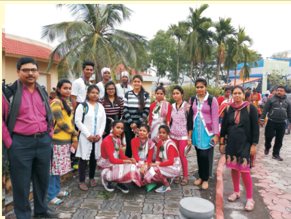
Exposure visit to Rabindra Tirtha for attending Tribal Festival organised by the WBTDCC, Govt. of W.B.

Anthropology is a subject with immense scope in various fields including government and non-government sectors. The Department of Anthropology of this college commenced in 2001 with an undergraduate (B.A. / B.Sc.) General course and subsequently the three years undergraduate (B.Sc.) Honours course started in 2004. The teachers use audio-visual means for teaching and organise exposure visits for the students. The department also organises special lecture programmes during each academic session. The students are also guided for their future endeavours by the teachers.