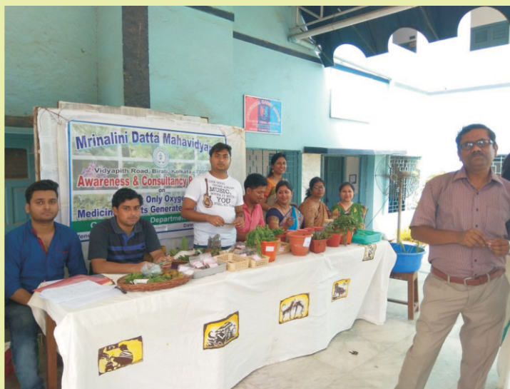
Awareness and consultancy programme of department on medicinal plants

Department of Botany started its journey from 2002 as a general degree subject. At that time the college was under University of Calcutta. Now it is under West Bengal State University, Barasat. The population of the district (24 Parganas, North) is ever increasing. There is no local degree college with Botany as honours subject within 5 KM radius from this college. The demand of local students for higher education in science stream becomes considerably multiplied. Honours degree in botany started in 2011-2012 academic session. We have three class rooms, one with LCD, a herbarium and a museum.