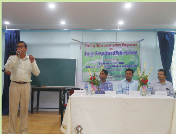
Participation of the department in science forum prog

The department of physics was established in 1996 as a B.Sc. General course, under the growing demands for introduction of science subjects in the college from the education-loving people of the locality. Subsequently, Honours course has been introduced in the session 2010-11. The department has all the necessary infrastructural facilities under one umbrella. Apart from normal class lectures and laboratory sessions, extra classes and special contact hours are arranged even after the selection test. Apart from academic exercise, the department organises Seminars and special lectures programmes.