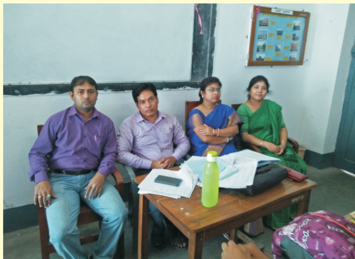
Faculties of the department of Sanskrit

The Sanskrit Department of the college was commenced in 1971 and subsequently honours course was introduced in 2002. The earnest desire of the department is the preservation and enrichment of Oriental Literature, Learning, Culture, Philosophy, Science and Thought. This wing of the college is actively engaged in to training its pupils in various subject specialisations and domains like Vedas, Indian Philosophy, Sanskrit Grammar & Linguistics. Our enthusiastic students organise Teacher's Day, Farewell and many other culture performances like music, dance, drama etc. in and from Sanskrit language and literature, while not neglecting their mother tongue.