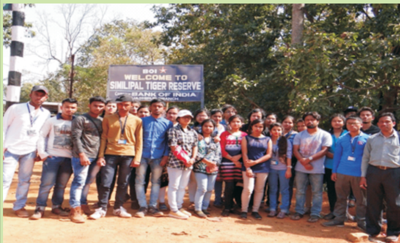
Field trip at Simlipal National Park, Odisha

The department of Zoology has started its journey in 2003 with general course and subsequently honours course was introduced in 2011. The department has 3 classrooms and two well equipped laboratories. The department has a strong focus on quality teaching with the help of modern teaching aids and innovative ideas. The department is maintaining a healthy and productive student – teacher interaction, it regularly publishes Wall magazines and also conduct field work, fair well and cultural programmes. The available Honours seats are almost filled up every session by students eager to join zoology honours.