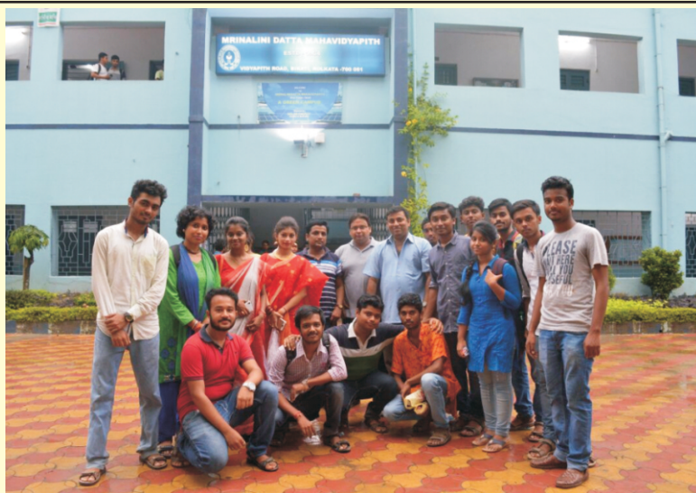
Students and faculties of the department

Keeping in tune with the demands of the 21 st century, and maintaining pace with the ever-changing job scenario, our college introduced the subject of Computer Science to be taught as a General subject in combination with Mathematics & Physics in the year 2004. The department had just two guest teachers back then. Honours course in Computer Science was introduced in the year 2008, with an enrolment of 15 students. In 2011 the first batch of Computer Science honours graduates of this college passed out with flying colours. Since then the department has maintained a steady pace of growth.