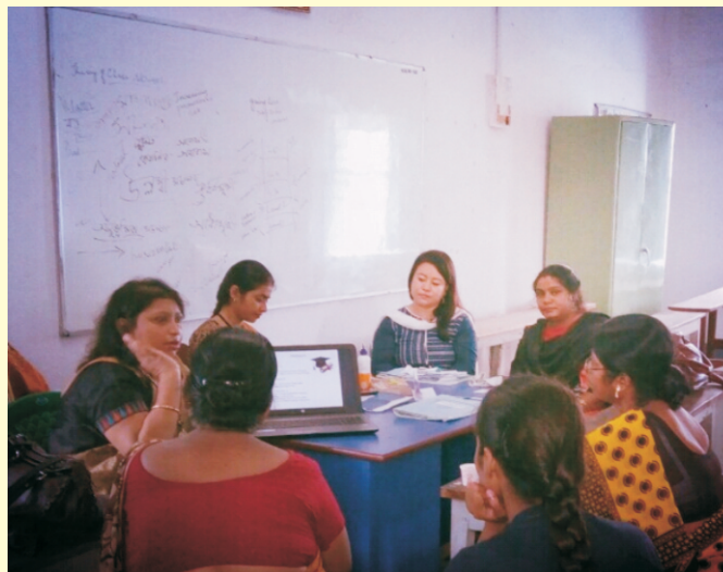
Career Counselling Session between the Faculty members, Students and Guardians

Sociology Honours was introduced in 2002 at Mrinalini Datta Mahavidyapith but Sociology as a general subject was introduced in the year 1998. With the passage of time the department has witnessed a steady rise in the number of students in both Honours and General stream. The department has two qualified teachers in substantive post, a Contractual Whole Time Teacher and a Part Time Teacher. The Department organises frequent Special Lecture Programmes, excursions and other cultural activities, The Department emphasises on Audio-Visual activities, power point presentations and class room discussion.