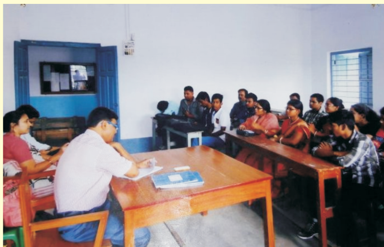
Parents-Teachers Meeting of the Department

The department of Commerce and Management was established in the year 1965 as a general course. Subsequently in the year 1970, honours course in accountancy and finance came into operation. Presently the department has the affiliation to run the M.Com. (PG) course. It is the general practice of the department to impart practical field exposure of our students for better understanding of the subject. The department regularly organises seminars, workshop programmes on current business issues.