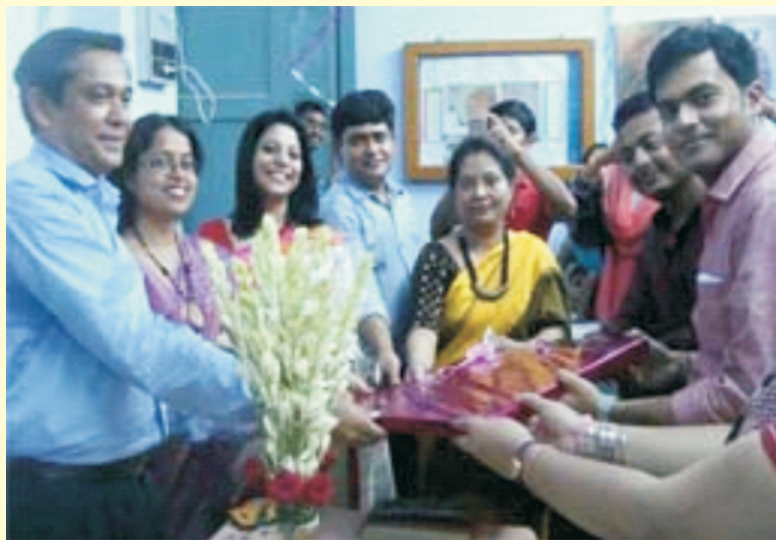
Celebrating alumni meet

Ever since the inception of our college, in 1964, the Department of History has been its proud and integral part. History has always been a popular subject with the students of the Arts stream in our college and at least 80% of B.A. General students opt for History in their three year course. Further, from its very introduction in 1996, the available Honours seats are almost filled up every session by students eager to join History Honours. In order to promote teaching-learning activities, the faculty uses audio-visual aids, arranges workshops, seminars, special lectures, documentary shows, encourages students' presentation, making of wall magazine 'Historia' and arranging excursions to places of historical interest every session.