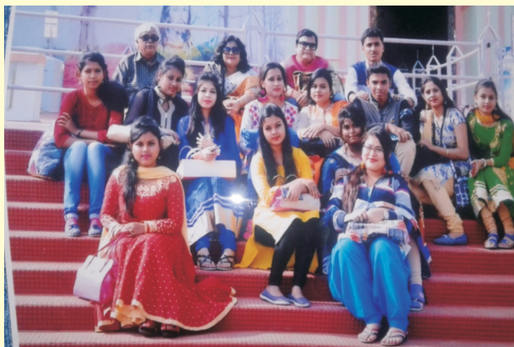
Educational excursion of the department at Bandel Church

The Bengali department is one of the oldest departments of the college which started its journey only with pass course in 1964. The honours course was introduced in 1968, followed by Post Graduate course in 2014. This department is well known for its educational brilliance since inception. Considering its cultural activities, it should be mentioned that the department has been performing a significant role from a long time. This department is proud of remarkable publication of the wall magazine which bears the sign of creativity of the students. The role of departmental excursion should be noted which brings the aim of infinite joy and intense eagerness among the pupil.