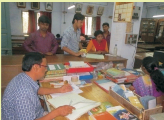
Library Staff Members

Lending service, Reading Room Service, Reference Service, Internet Service, Online Public Access Catalogue (OPAC), Online Journal Access, Repository for current as well as previous years' question papers are some of the main services available in the library. Apart from these, time to time library also organises extension activities like book fair, orientation program etc.