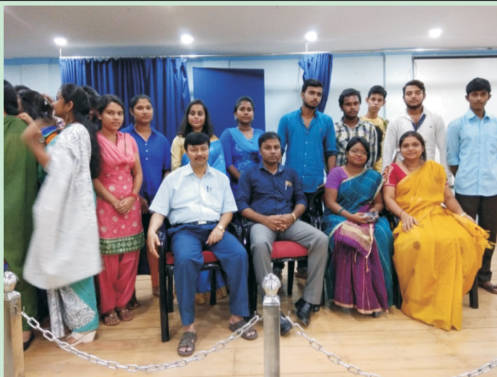
Academic Counselling Programme for 3 rd Year Students

The Department of Education was established in the year 1964 with its General Programme. With the passing of time and the gradual demand of the society as well as the success rate of the students of general course in this subject led the college authority to open the Honours and MA programme in Education in the year 1996 and 2018 respectively. The department regularly conducts educational excursion, cultural programme etc. Presently we have applied for the PhD programme in Education to West Bengal State University.