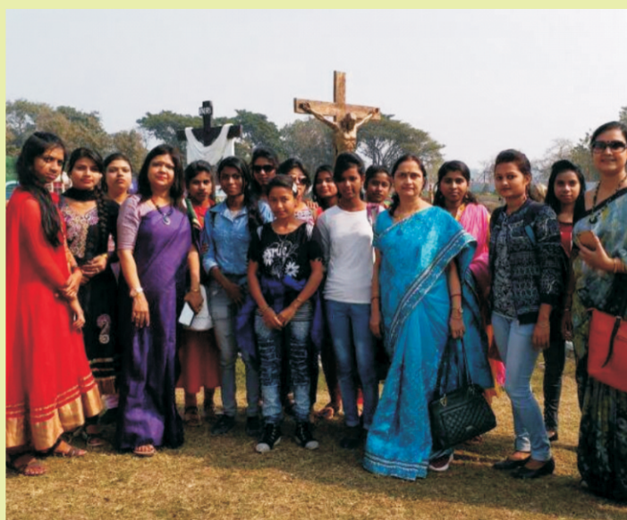
Educational excursion of the department at Bandel Church

The department of Philosophy is one of the few departments with which our institution MDM started its journey in 1964. At the time of its inception, the department offered only the pass course and later introduced honours course in 1995. The department regularly organizes seminars, workshops and special lectures by eminent academicians. Wall Magazine "Darsan Darpan" and departmental journal "Darsan Manjari" are also published on issues bearing philosophical significance. The department maintains a regular contact with the guardians to convey their wards' progress. Apart from academic activities, the department offers psychological counselling session for improving the mental well being of the students.