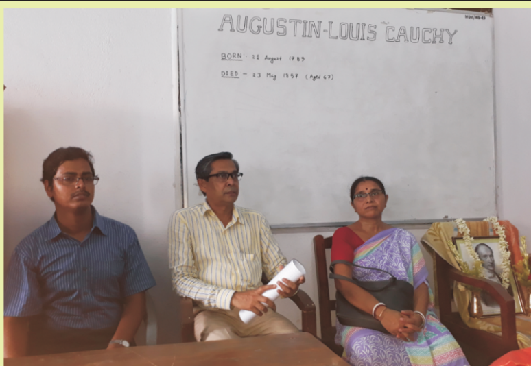
Birthday Celebration of Augustin-Louis Cauchy

The Department of Mathematics was commenced in 2004 with an introduction of undergraduate general course and subsequently the honours course was started in 2010. Irrespective of having one full time faculty the department is able to run the Honours and General courses successfully. Faculty uses various modern teaching aid and apply different innovative ideas of teaching. Teachers are actively involved in research, creating a very suitable academic ambience. The department arranges different lecture programme and interactive sessions.