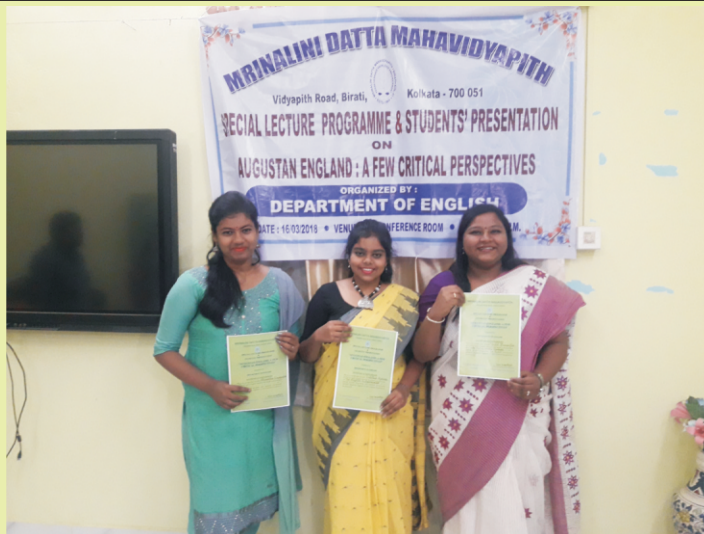
Students' Presentation being Awarded

The Department of English began its journey along with the inception of the college on March 5, 1964. A new chapter was added to the department as Honours course was introduced in 1998. The department flourishes not only through its regular teaching-learning process, but also through a host of enthusiastic activities and programmes. It regularly conducts an annual Special Lecture programme, philanthropic activities, as part of Institutional Social Responsibility, counselling of the guardians, walling up of two creative wall magazines, Fortnightly Yours and Montage. An output of the research centric endeavour of the faculties and alumni is Ripples, our departmental Journal.