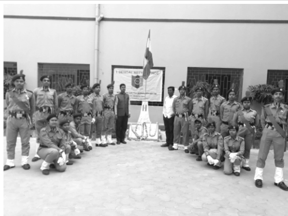
Celebration of Republic Day by NCC Cadets

Contact us (Mob. 9243269721) for enrolment and training programme.