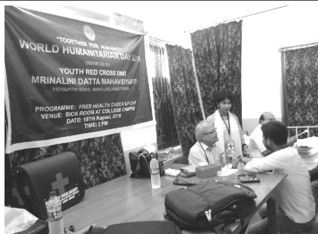
Celebrating World Humanitarian Day by Volunteers of Youth Red-Cross Unit of the college