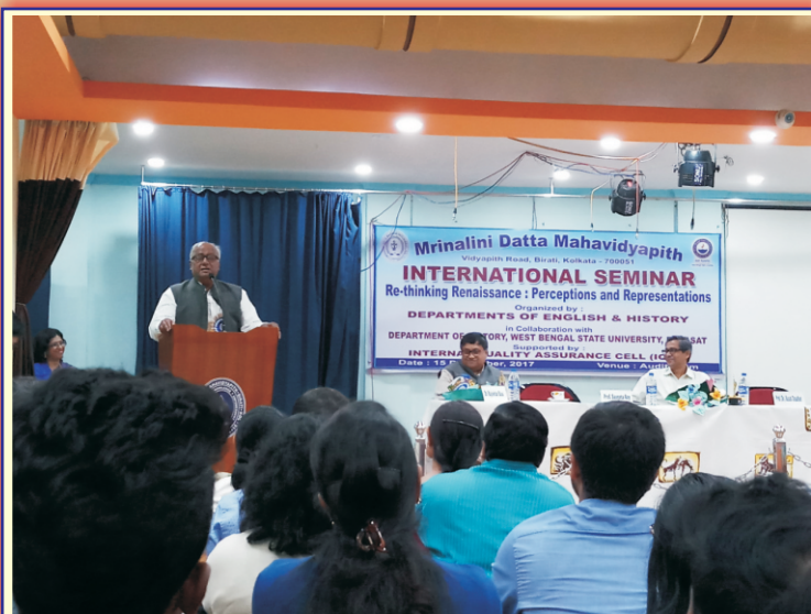
Speech by Hon'ble President of our college during International Seminar