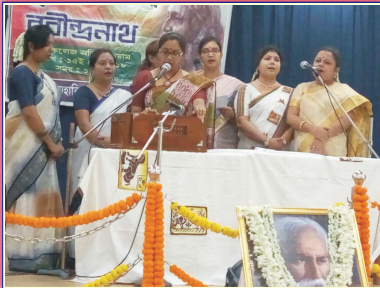
Celebration of Rabindra Jayanti