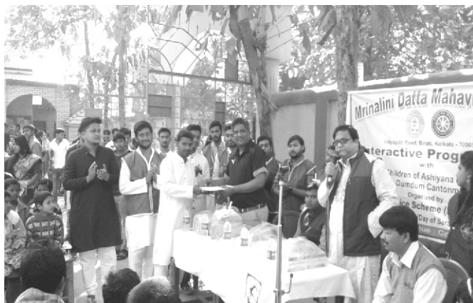
Interactive Programme with Destitute Children of Ashiyana Dumdum Cantonment by NSS Volunteers

Contact us (Mob. 9874556847 / 9836624446) for enrolment and training programme.