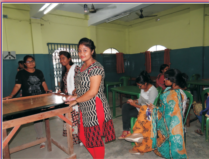
Girls' Common Room