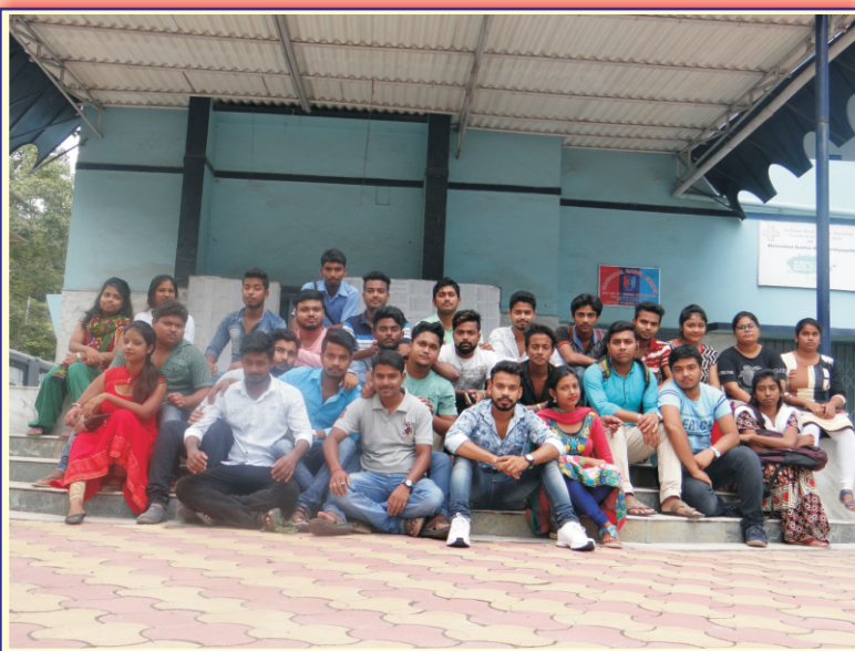
Mukta Mancha of our College