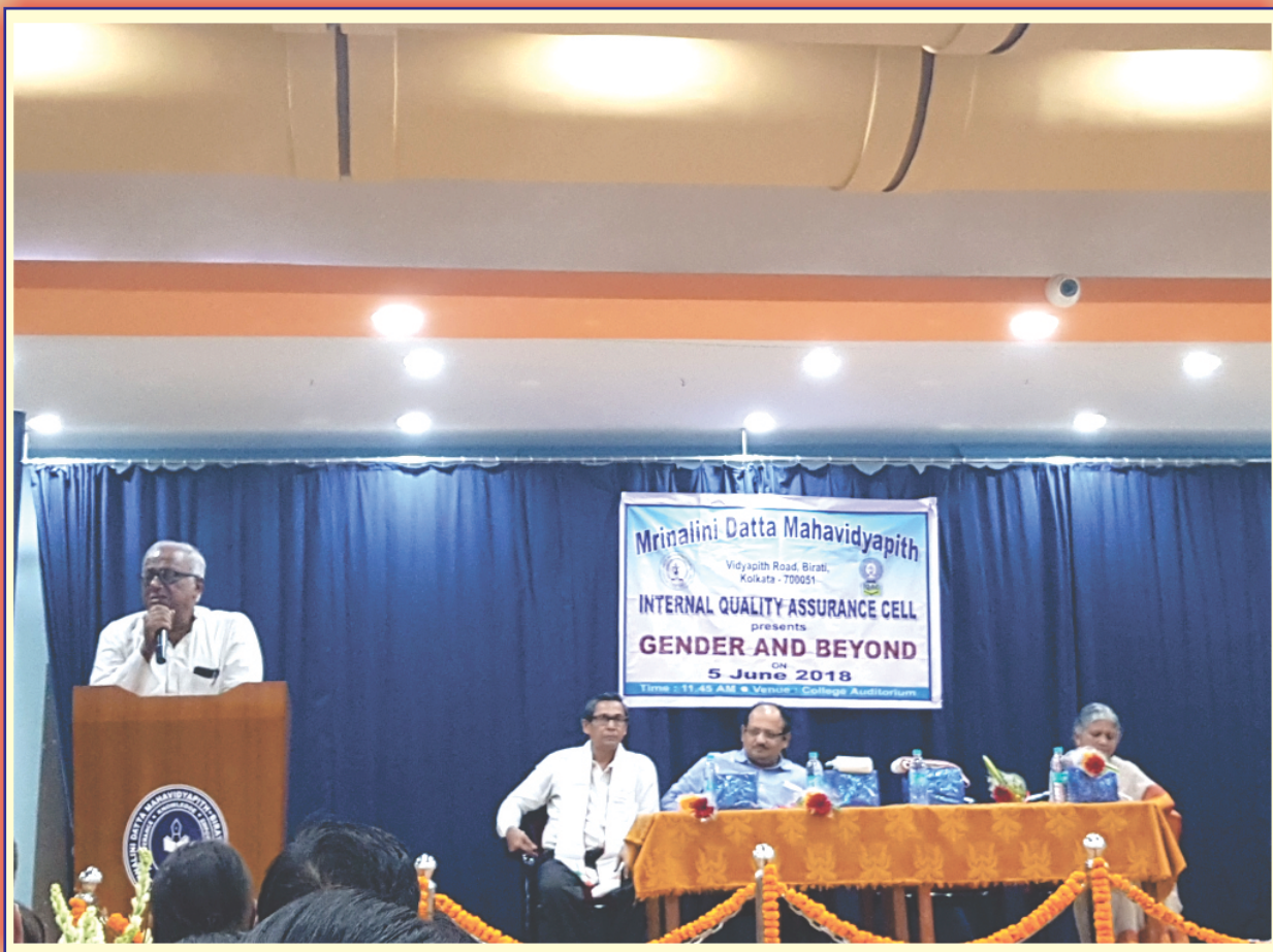
A much needed programme (Seminar on : Gender & Beyond ) Organised by IQAC