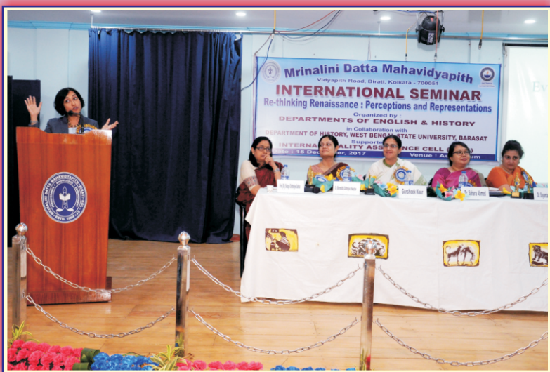
A vignette from the International Seminar