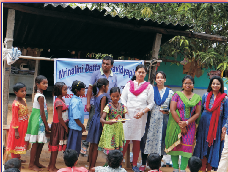
Outreach Programme Conducted by Faculties of our college at Adivashi Asharam School, Purulia