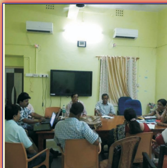
IQAC Member are conducting meeting