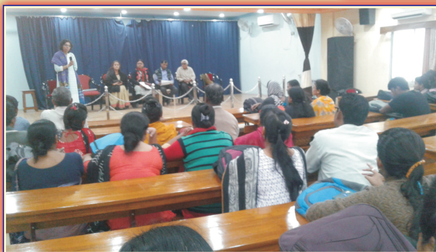
Academic Counselling Session