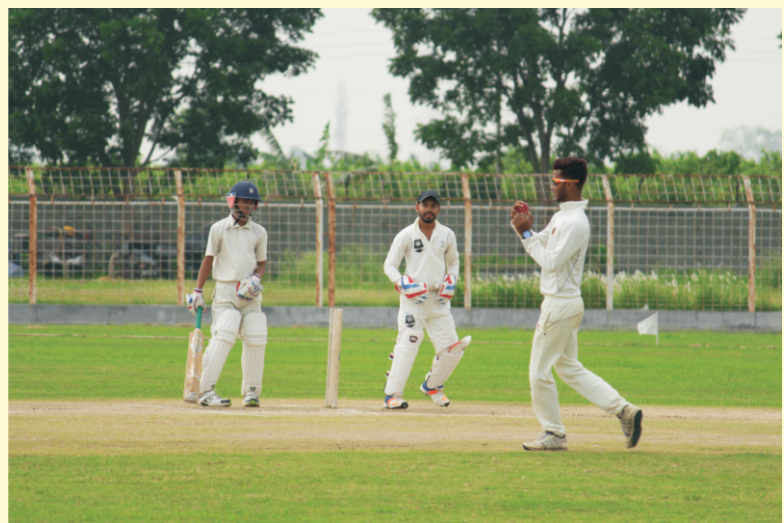
Cricket Match in progress