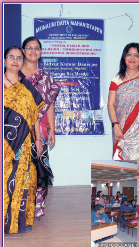
Psychological Counselling Session