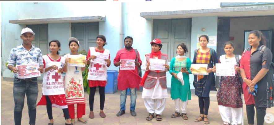
Figure 8: Awareness program on Heat Stroke by Youth Red Cross Unit