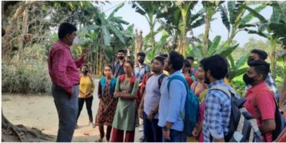
Figure 3: Fieldwork by Anthropology department