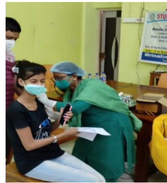
Figure 6: Student getting the vaccine