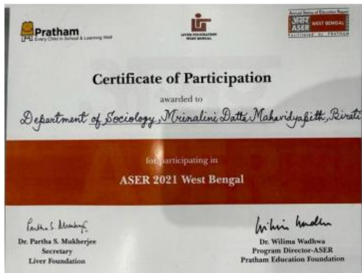
Figure 2: Certificate of participation in ASER 2021