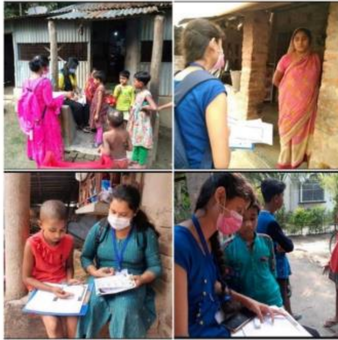
Figure 1: ASER survey the students of Sociology department