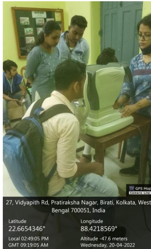
Figure 7: Free eye check up camp by NSS unit