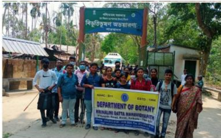
Figure 4: Educational excursion by department of Botany