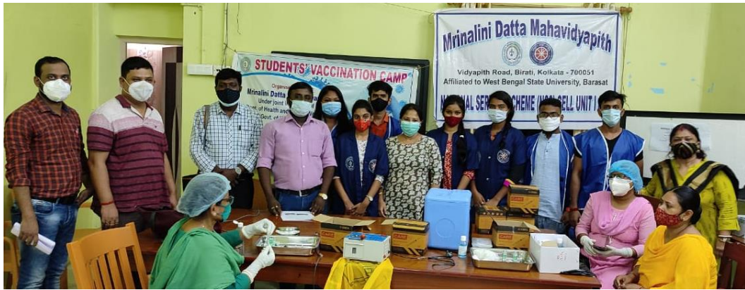
Figure 5: Vaccination camp for students of the institution